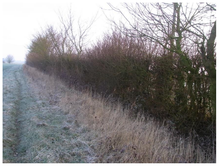
Figure 6. East hedgerow.