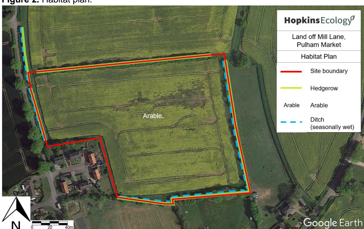
Figure 2. Habitat plan.

4.1 The Site (Figure 2) comprises a single arable field with a small residential estate to the southwest, dating from the late-1980s / early-1990s. The soil is classed as a 'slowly permeable seasonally wet slightly acid but base-rich loamy and clayey soil'.