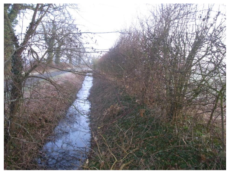
Figure 8. West boundary, with hedgerow and ditch.