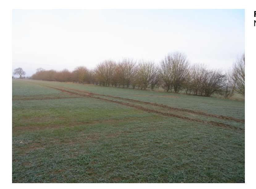
Figure 7. North hedgerow.