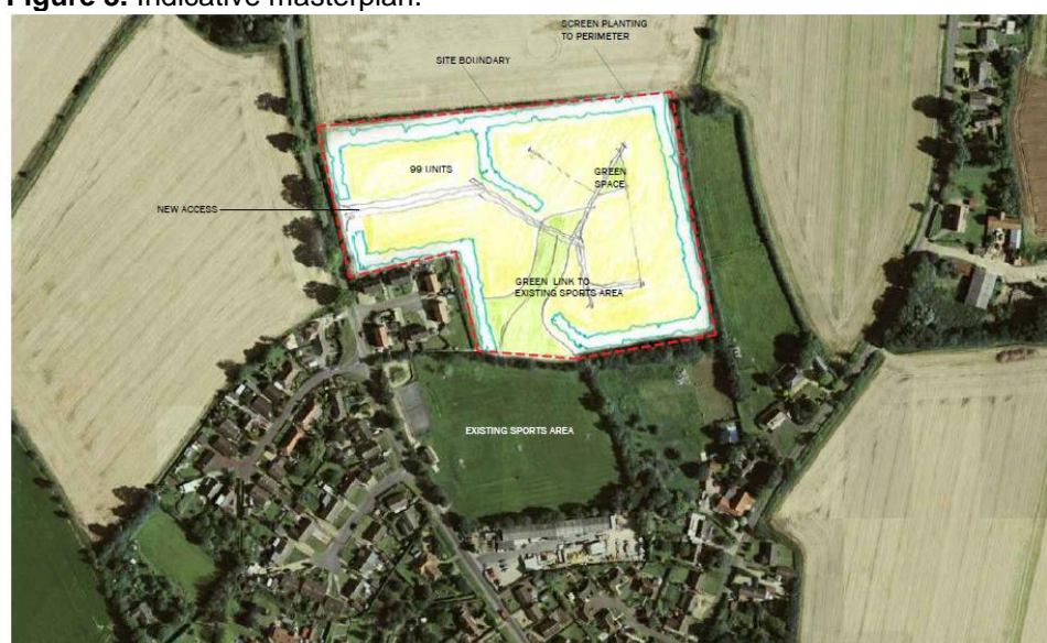
Figure 3. Indicative masterplan.