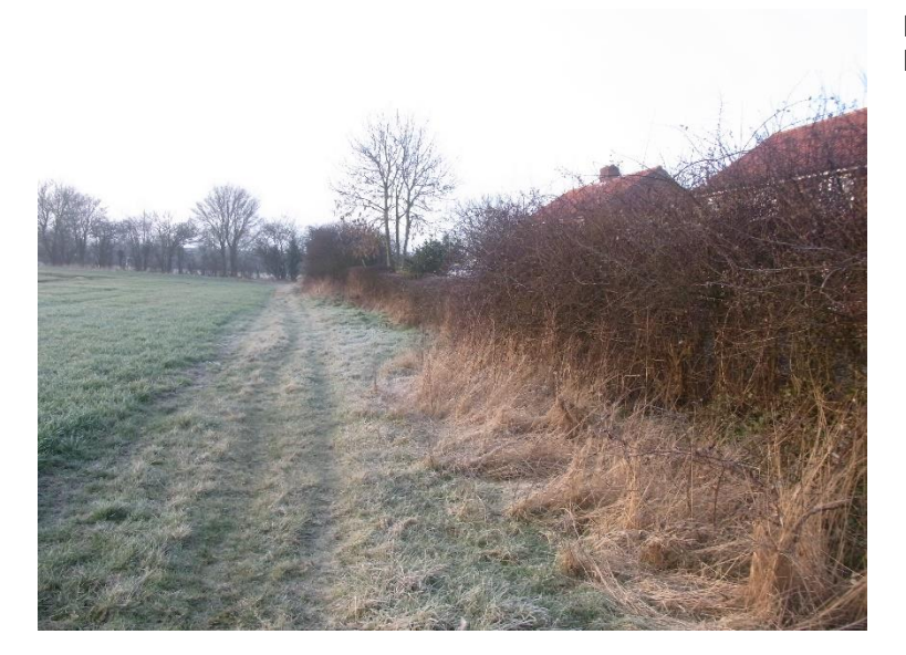
Figure 5. Boundary to garden curtilages.