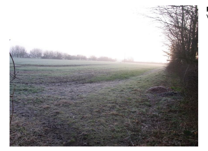
Figure 4. View from south-west.