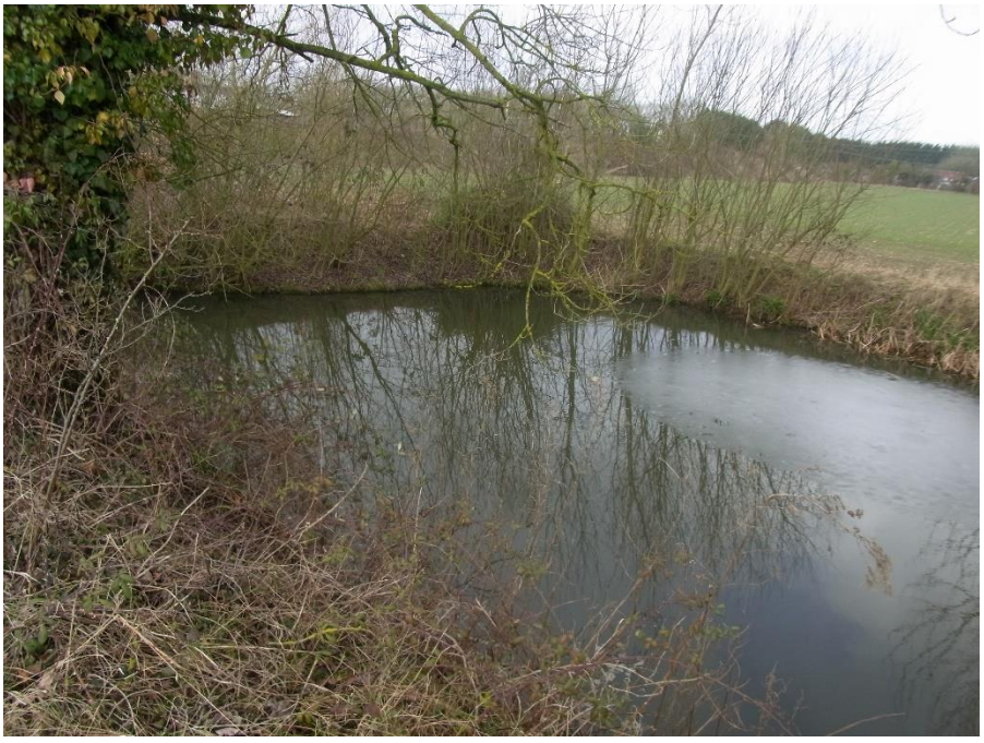
Figure 8. On-Site pond.

Figure 7. Hedgerows H2 and H1 (near and far distance respectively), looking north on Shelfanger Road.