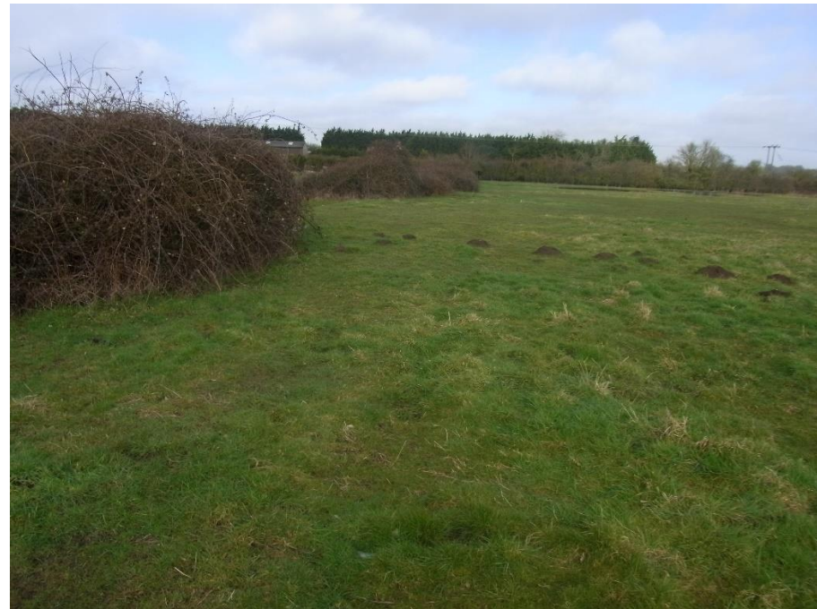
Figure 3. Improved grass field (east).