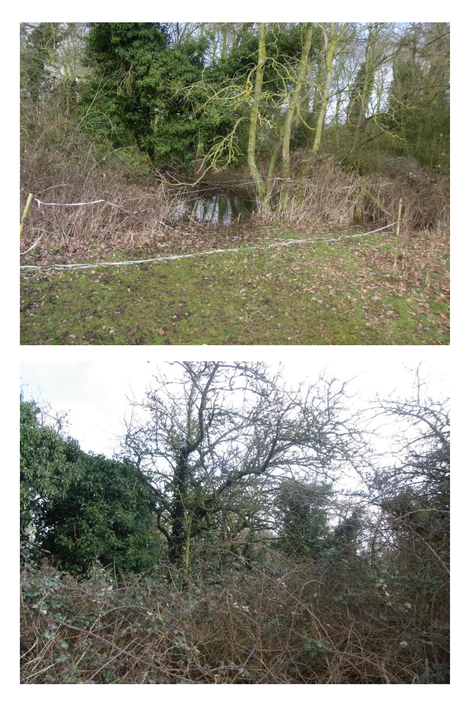
Figure 9. Off-Site woodland with flooding.