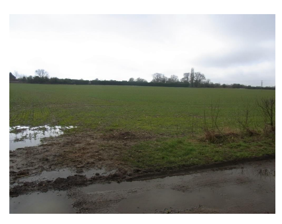
Figure 5. Open arable field, looking towards the south boundary.