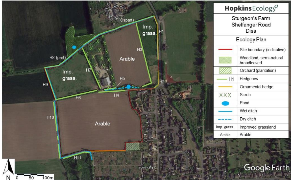
Figure 2. Habitat survey map.

5.1 The Site comprises several fields, both arable and improved grass swards, with partial boundary hedgerows and scrub, ditches and a pond (Figure 2). There is a compound used for farm materials and this includes a large, modern barn. Off-Site is a block of woodland and an orchard. The soil is classed as a 'slowly permeable seasonally wet slightly acid but base-rich loamy and clayey soils'.