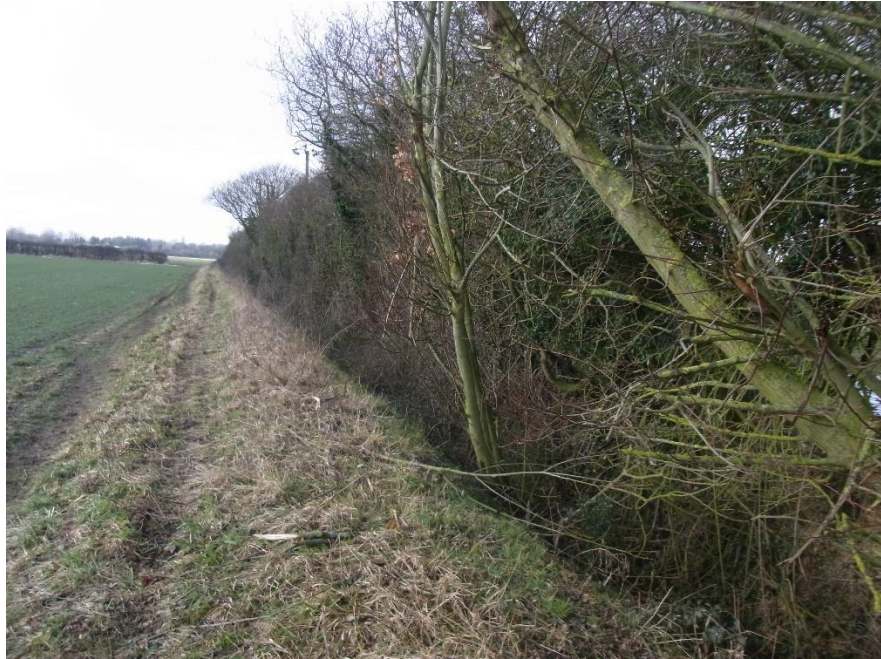
Figure 6. Hedgerow H9, looking north off-Site.

Figure 5. Open arable field, looking towards the south boundary.