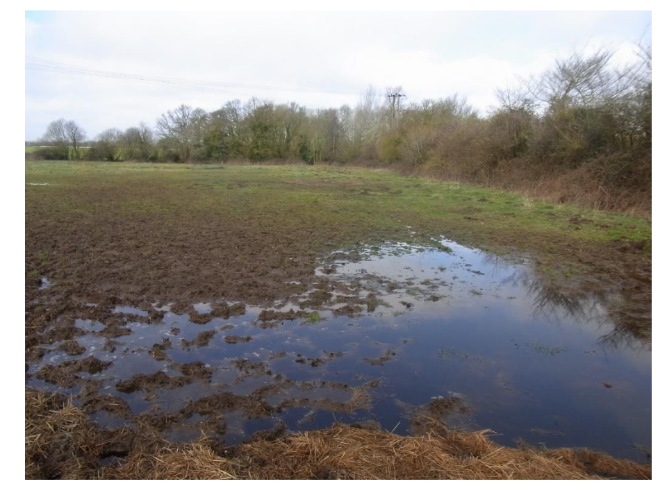
Figure 4. Improved grass field (west).