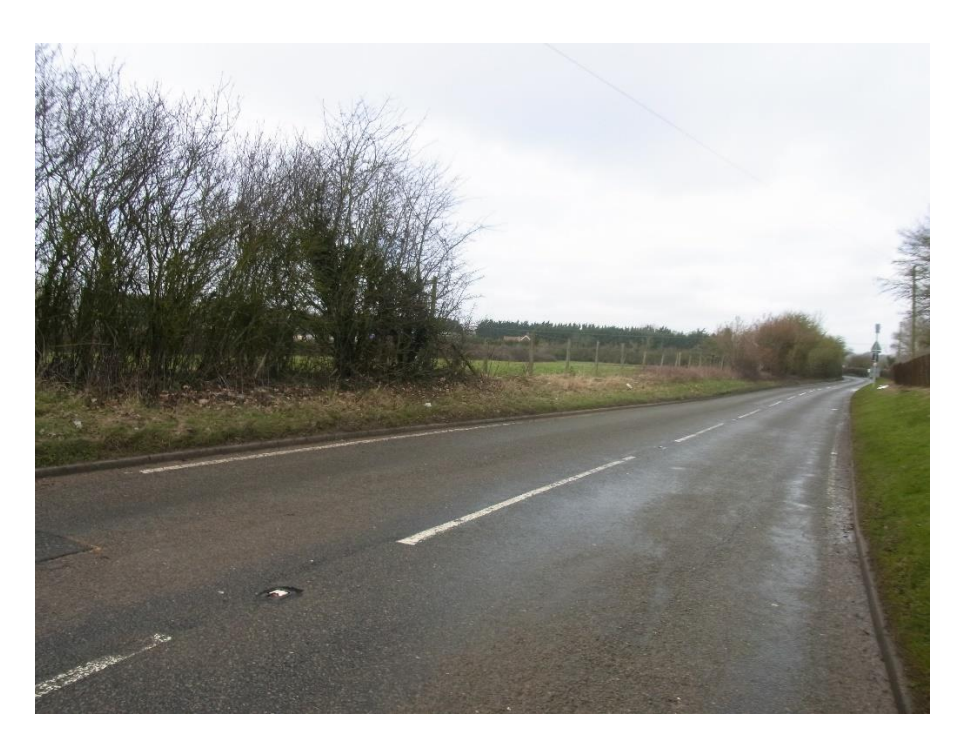
Figure 7. Hedgerows H2 and H1 (near and far distance respectively), looking north on Shelfanger Road.