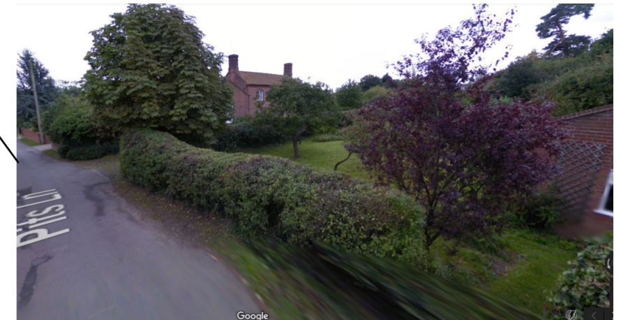
View South down Pits Lane, Old School house in background.