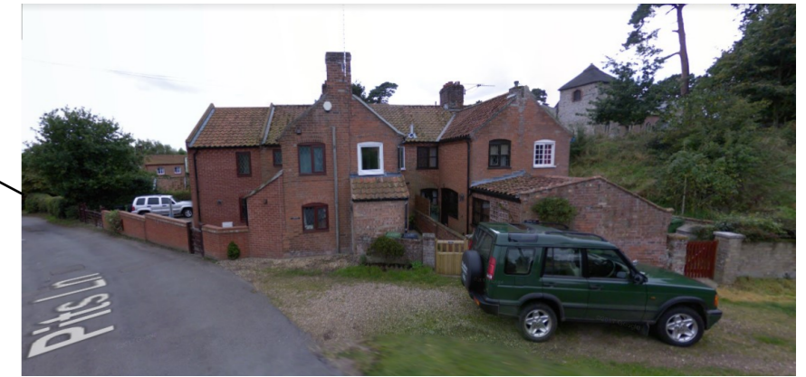
View South down Pits Lane, All Saints Church in background