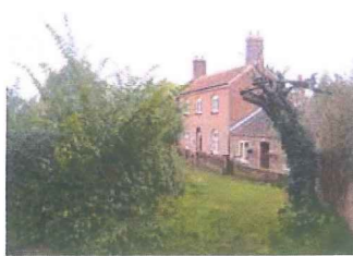
The Old School House. As viewed from the footpath south of All Saints Church

The church and its elevated position dominate this small separate conservation area. The churchyard is bordered by trees and hedges but there are gaps which allow views in and out especially over to the east. The extensions to the Church have been successful. The low lying playground to the north serves to emphasise the stature of the church. There is a group of cottages sheltering to the east of the church but beyond these the value and arrangement of buildings lacks interest. There is a footpath immediately south of the churchyard which is lined with mature trees and which opens out moving eastward to bring The Old School House into view, an attractive 19th century group of buildings set back from the road adjacent to the footpath.