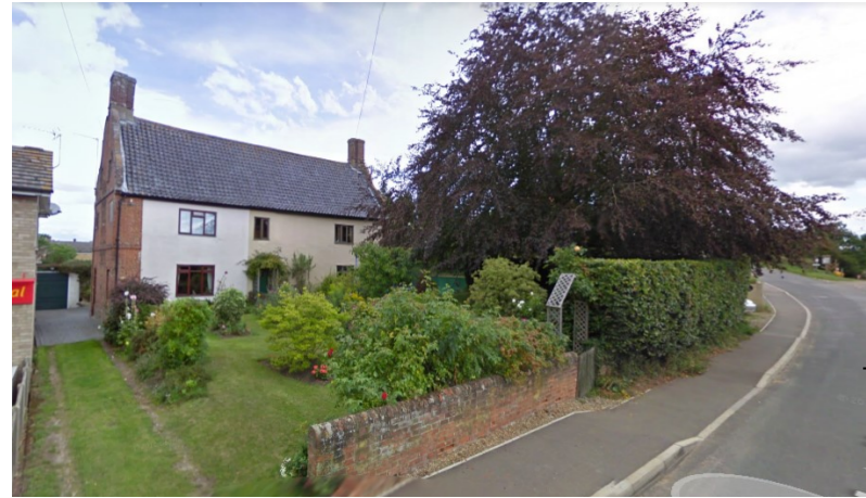
7 & 9 Hardley Rd