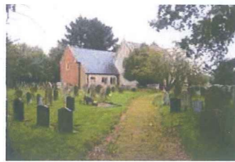
Churchyard at All Saints Church