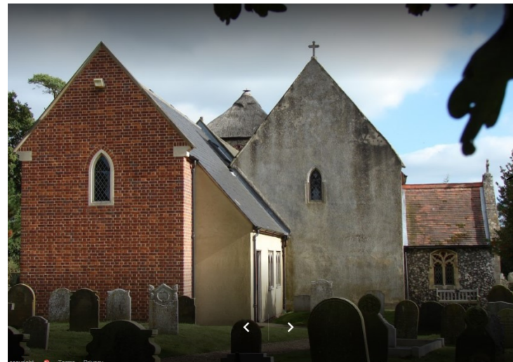
All Saints Church