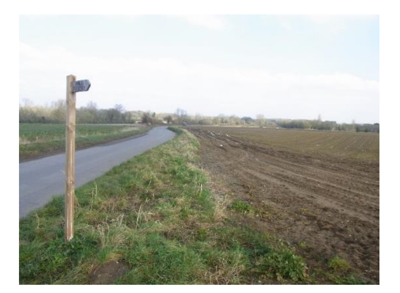
Figure 9. Melton Road boundary, looking north-east. Grass sward along route of former hedgerow but now lacking woody vegetation.