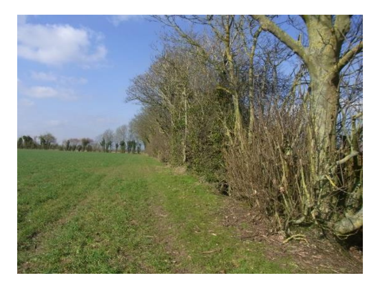
Figure 11. Hedgerow (HU12)