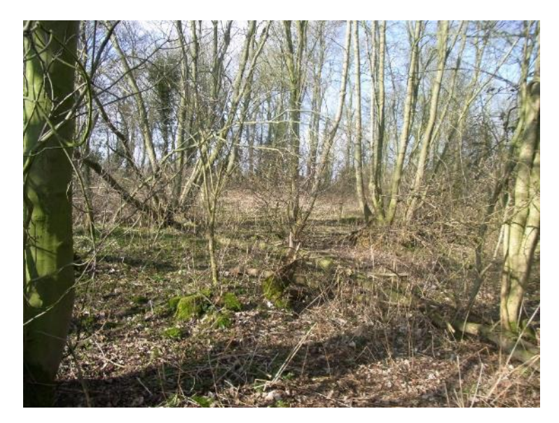
Figure 12. Semi-natural broadleaved woodland, near east boundary.