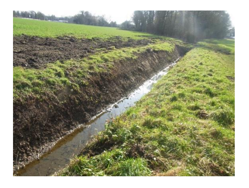
Figure 14. Flowing ditch.