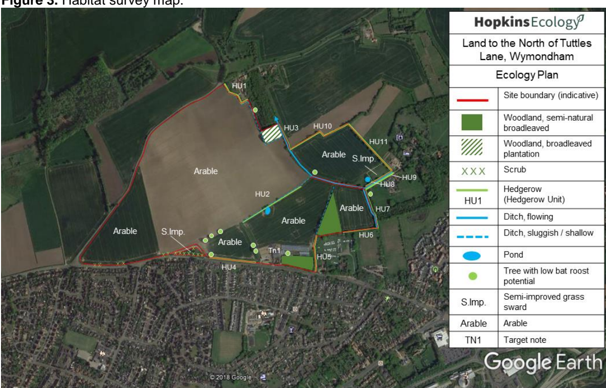
Figure 3. Habitat survey map.

5.1 The Site is largely arable cropland, with a single field extending to over 35ha in area and a total area of circa 55ha. At the time of survey, the arable fields were not under a crop, presumably in anticipation of spring ploughing. As well as arable fields there are lengths of hedgerow, some grass swards, woodland, ditches and two ponds (Figure 3). The soil is classed as a 'lightly acid loamy and clayey soil with impeded drainage'.