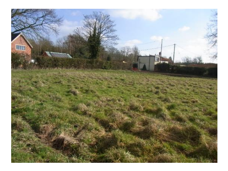
Figure 8. Semi-improved grass sward adjacent to east boundary.