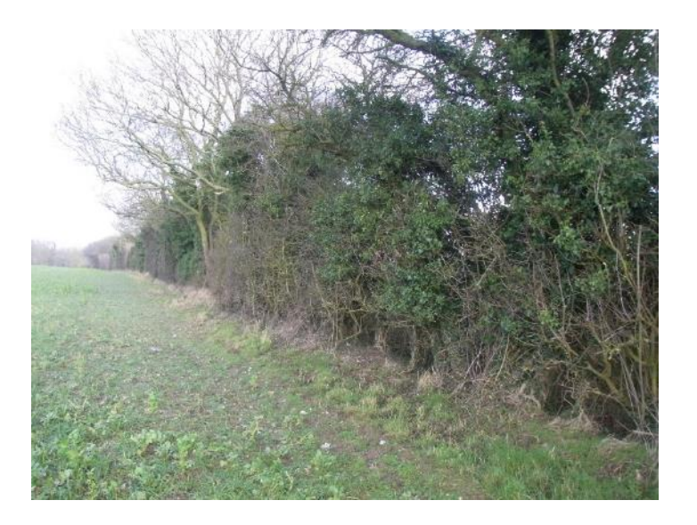
Figure 10. Hedgerow (HU2)