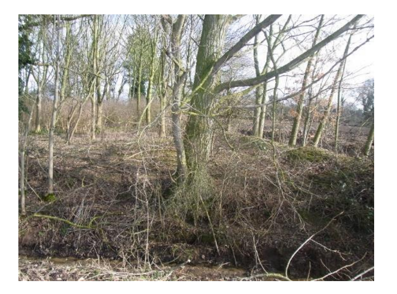
Figure 13. Semi-natural broadleaved woodland, adjacent to Tuttles Lane East.