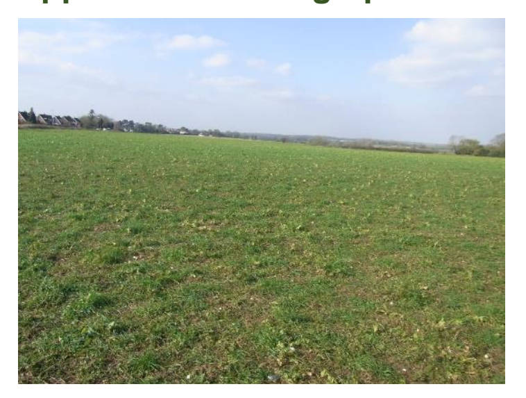
Figure 6. Arable field, with adventitious weeds and brassica seedlings.