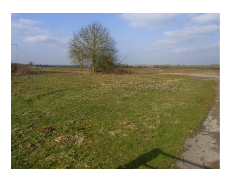
Figure 7. Semi-improved grass sward adjacent to Tuttles Lane East.