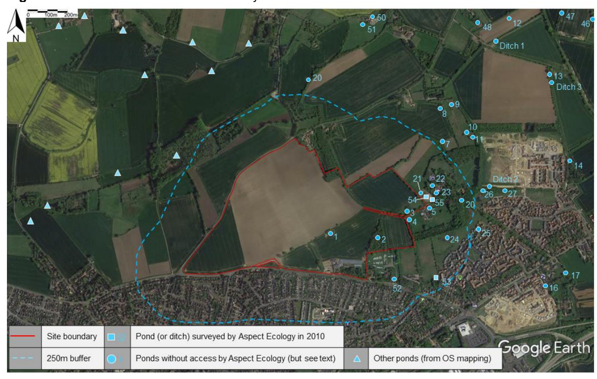
Figure 4. Ponds within the Site and nearby with 250m buffer shown.