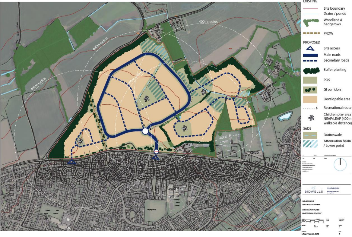
Figure 5. Scheme masterplan strategy.