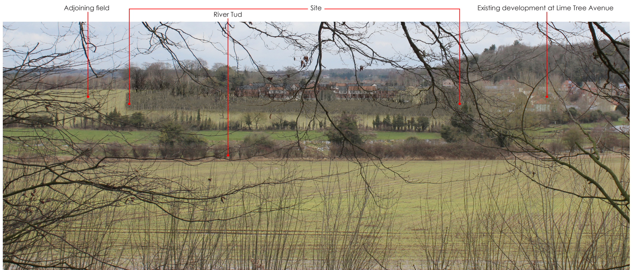
Illustrative winter view from East Hills Woods at 10 years after development