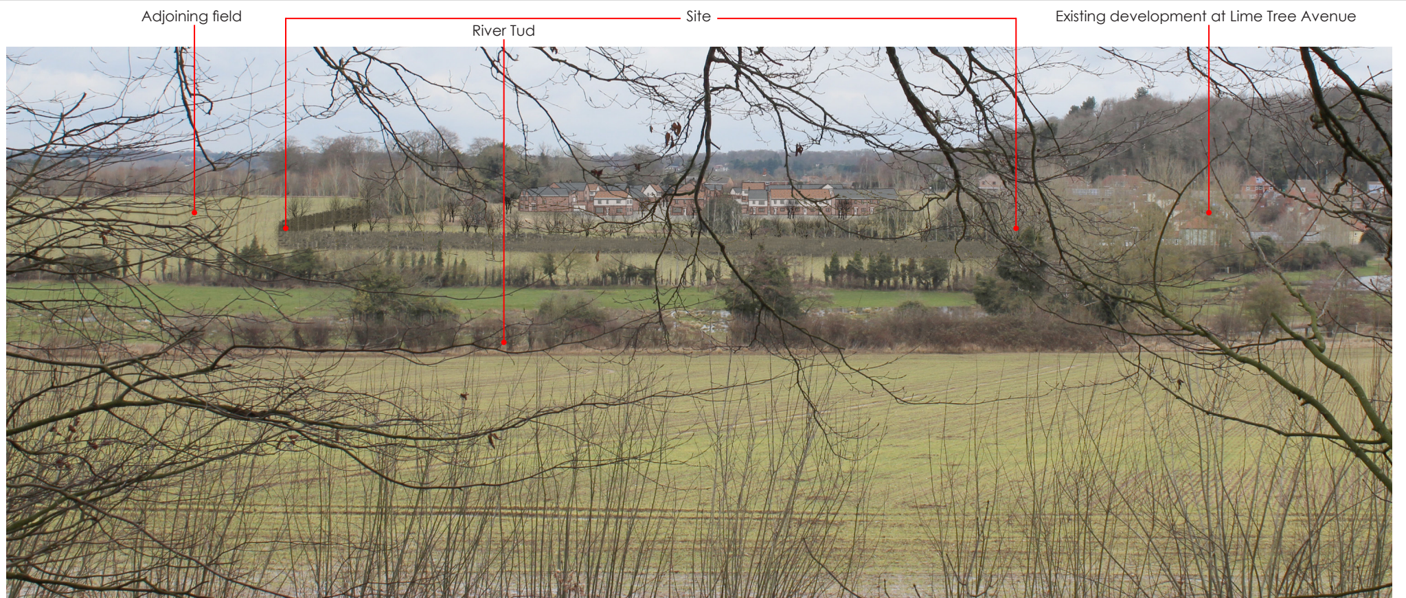
Illustrative winter view from East Hills Woods at 1 year after development