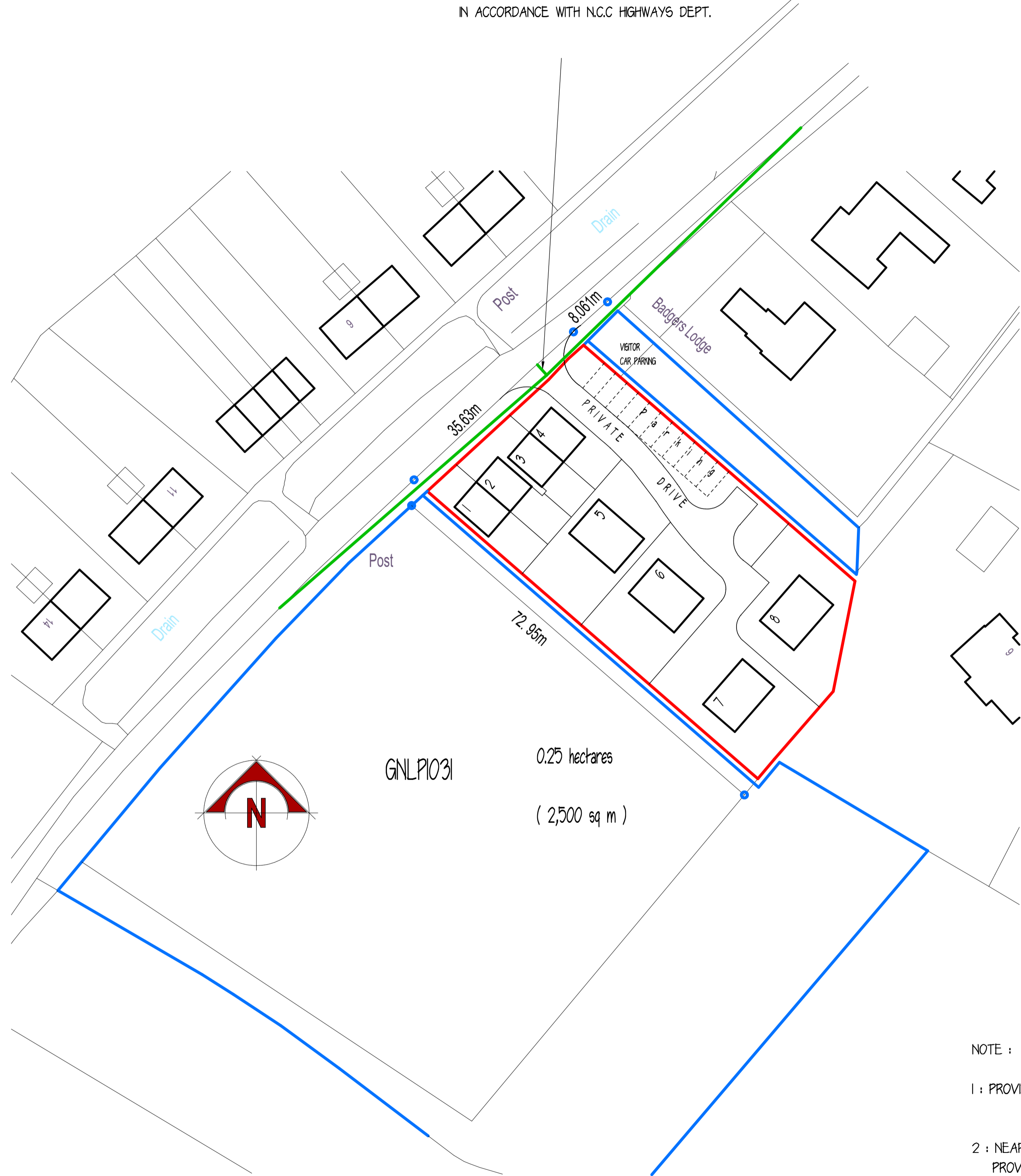
SITE LAYOUT 1 : 500

PROVIDE 2.40M X 59.0M VISIBILITY SPLAYS IN BOTH DIRECTIONS IN ACCORDANCE WITH N.C.G. HIGHWAYS DEPT.