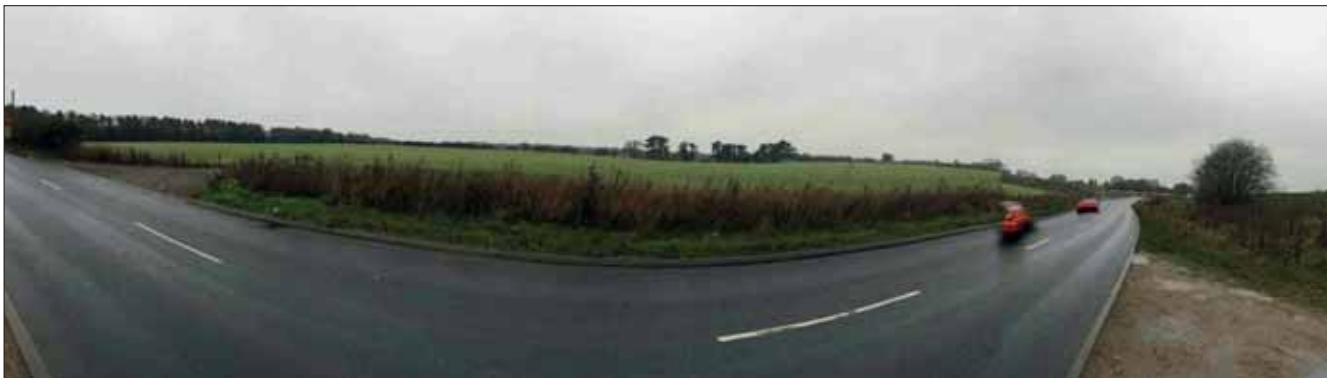
VISUAL IMPACT ZONE 3