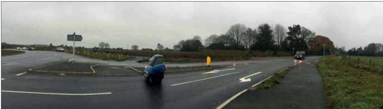
VISUAL IMPACT ZONE 2