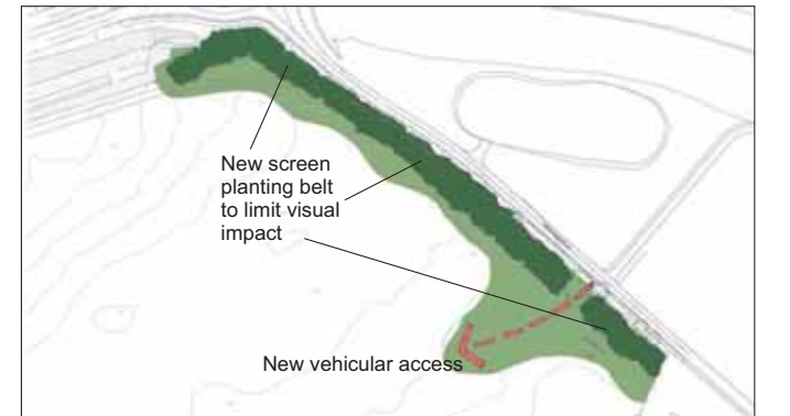
VISUAL IMPACT ZONE 3