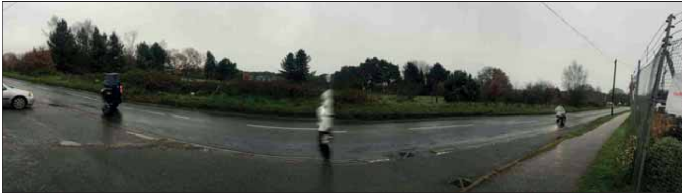
VISUAL IMPACT ZONE 1