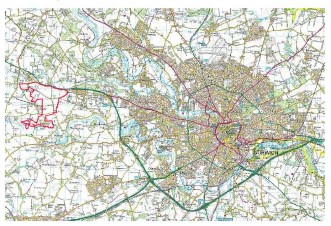
Inset 2-1: Site location plan

There are existing buildings located south and south-east of 'Phase 1 West' and to the west of 'Phase 1 East'. As the Site has not been previously developed, it is considered a greenfield site. The 'Phase 1' locations are shown in Insert 2-1.