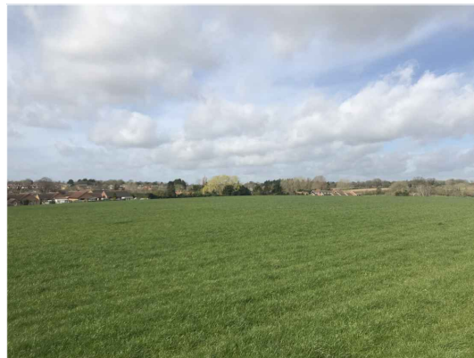
9. Looking north west from eastern boundary of site towards north west corner