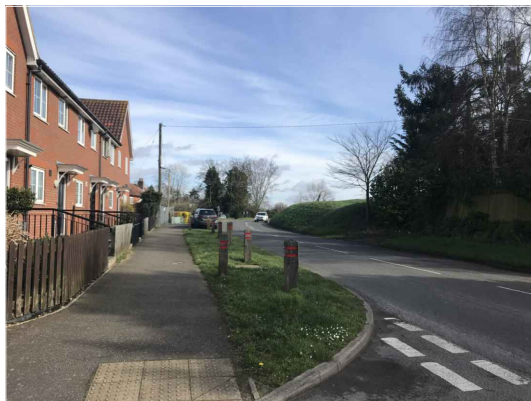
1. Looking east along Redenhall Road towards site frontage