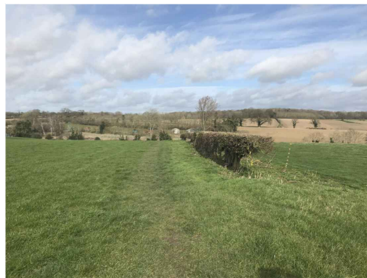
6. Looking north from top of development site towards north east corner