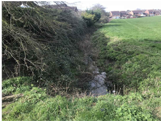
10. Looking west along southern boundary of site showing existing ditch