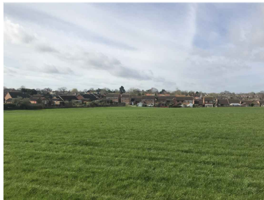
8. Looking west from eastern boundary of site towards south west corner