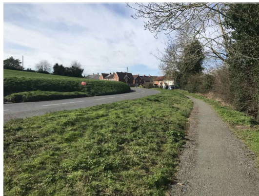
2. Looking west along Redenhall Road along site frontage