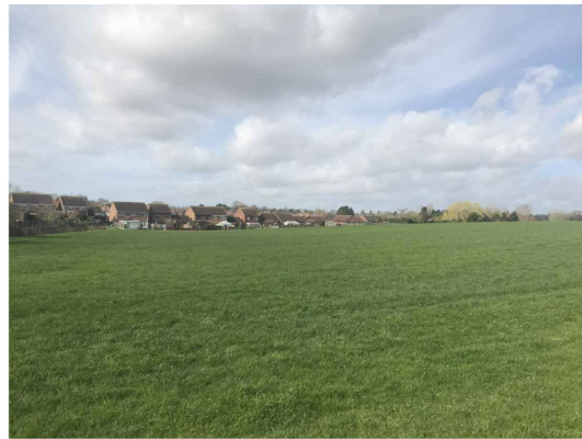
12. Looking west along southern boundary of site showing existing adjacent dwellings