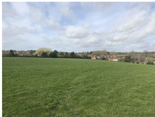
5. Looking north west from top of development site towards north west corner