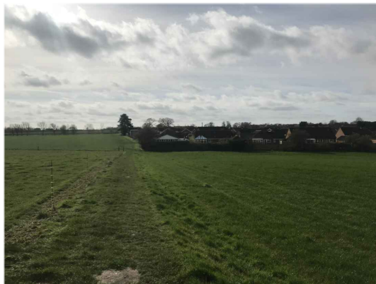
7. Looking south from eastern boundary of site towards south east corner