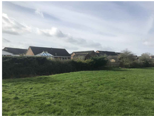
11. Looking south along southern boundary of site