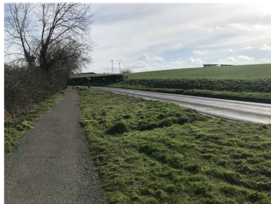
3. Looking east along Redenhall Road along site frontage