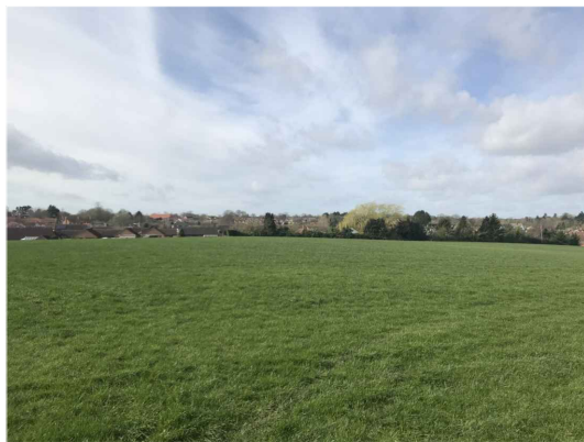
4. Looking west from top of development site towards existing dwellings