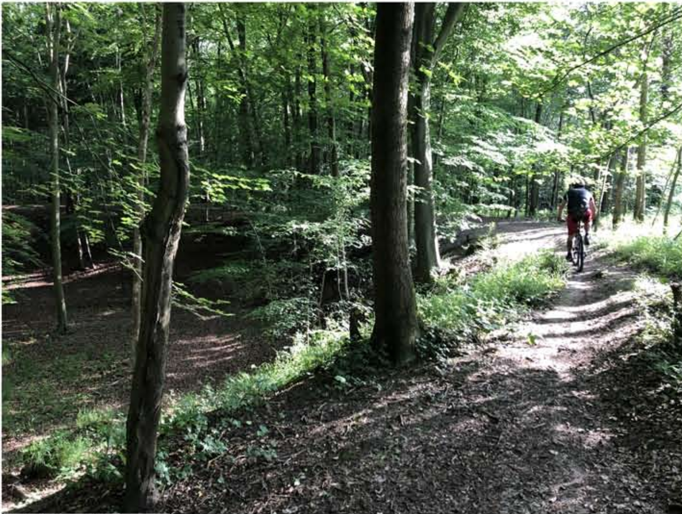
Concept for New Woodland