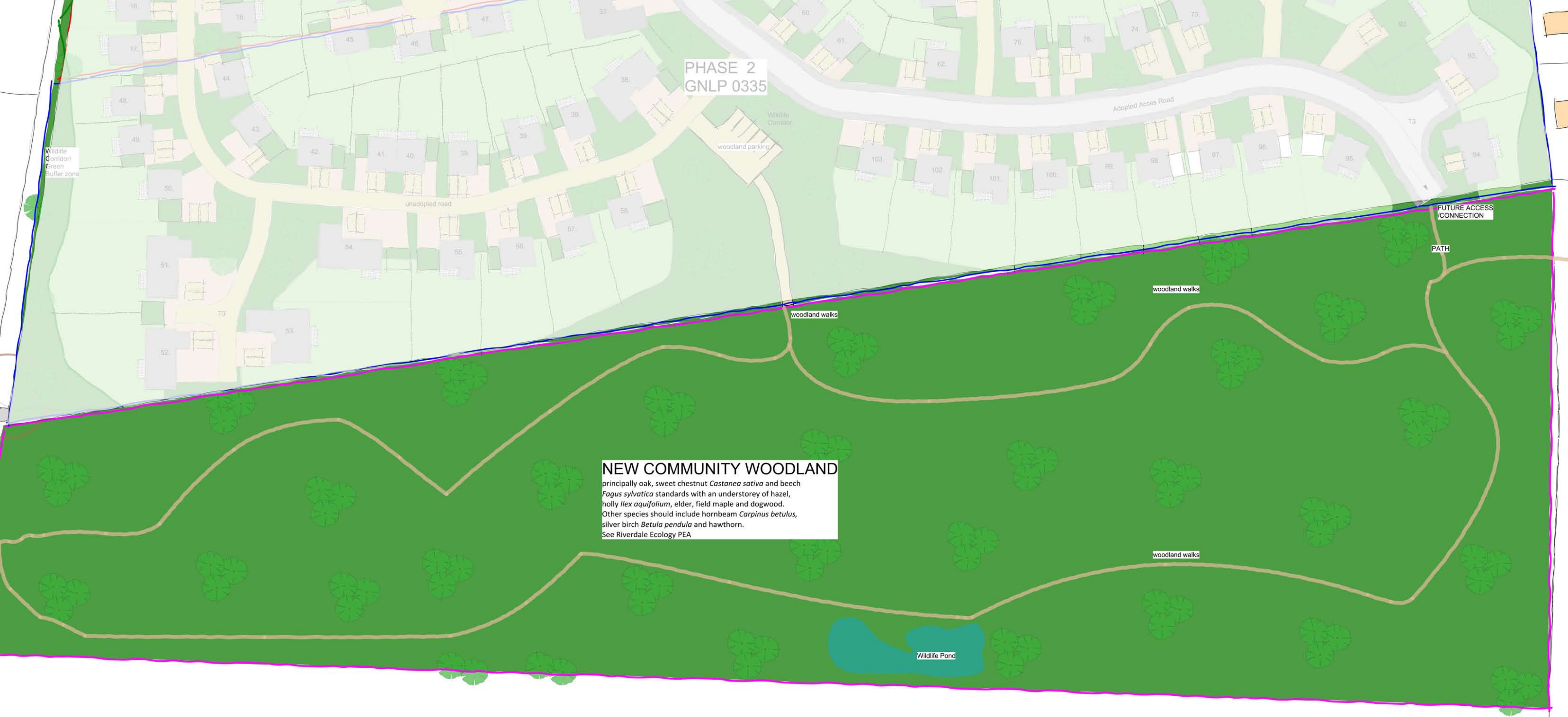
New Community Woodland Scale: 1:500