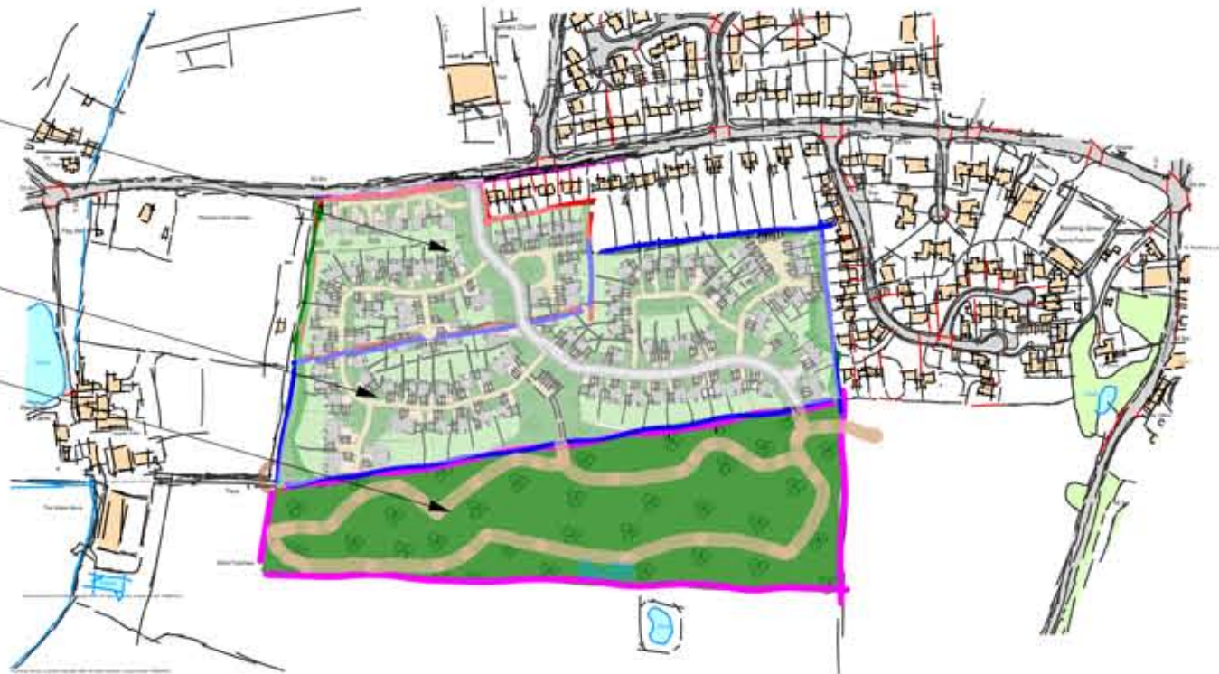
New Community Woodland Scale: 1:5000