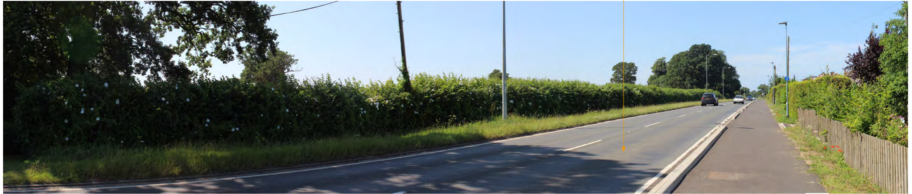
PHOTO VIEWPOINT 3: VIEW WEST TOWARDS WYMONDHAM FROM THE B1172 (NORWICH COMMON) AT THE PARK FARM HOTEL ENTRANCE

Properties off B1172 located within the Strategic Gap