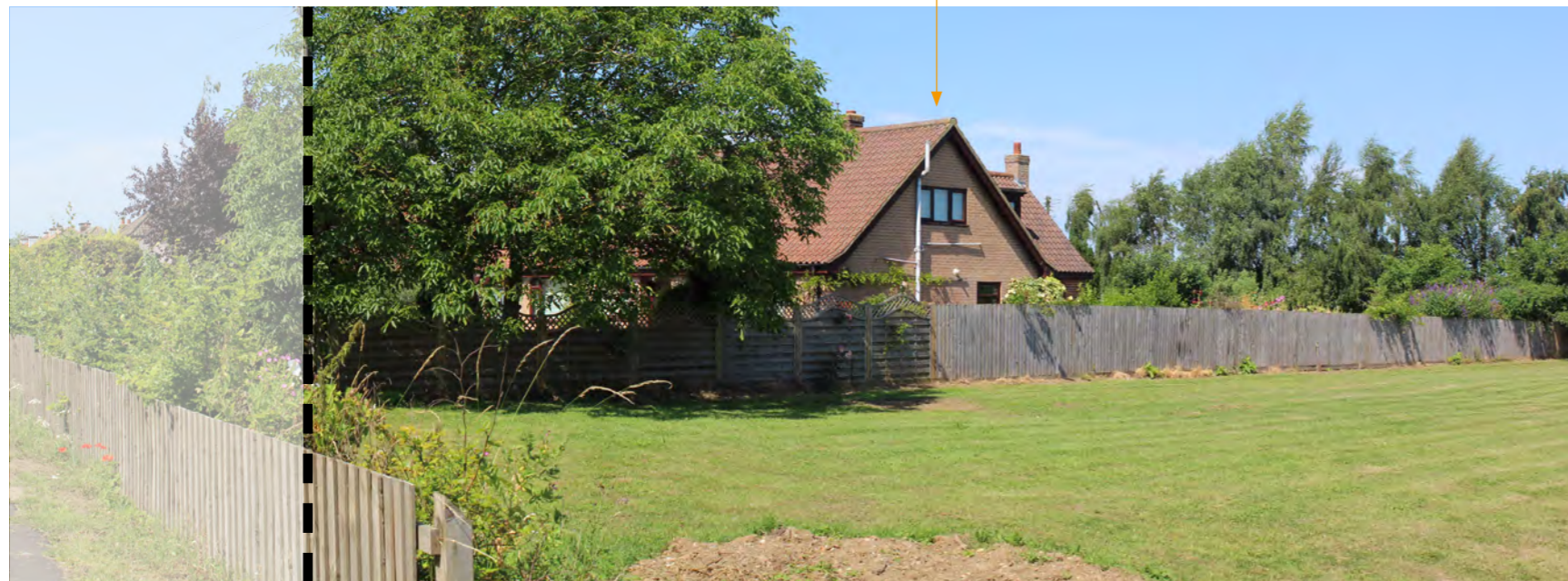
PHOTO VIEWPOINT 3: VIEW WEST TOWARDS WYMONDHAM FROM THE B1172 (NORWICH COMMON) AT THE PARK FARM HOTEL ENTRANCE (continued)

Properties off B1172 located within the Strategic Gap