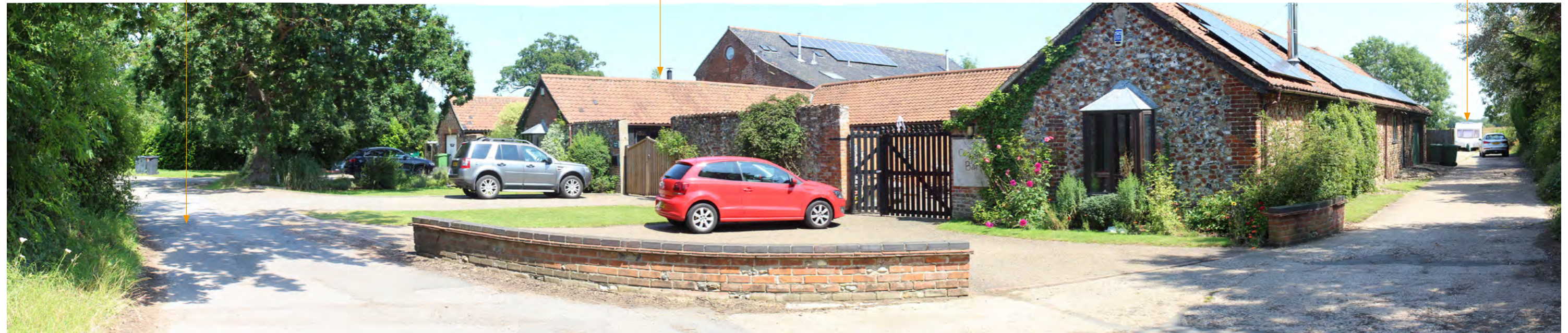
PHOTO VIEWPOINT 1: VIEW NORTH EAST FROM SPINKS LANE ON THE WESTERN BOUNDARY OF THE STRATEGIC GAP