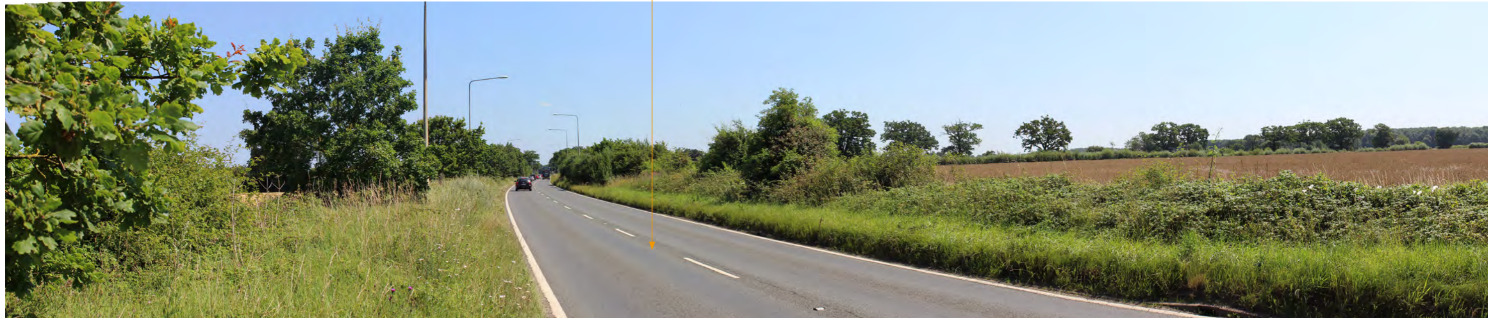
PHOTO VIEWPOINT 2B: VIEW EAST TOWARDS HETHERSETT FROM WITHIN THE STRATEGIC GAP