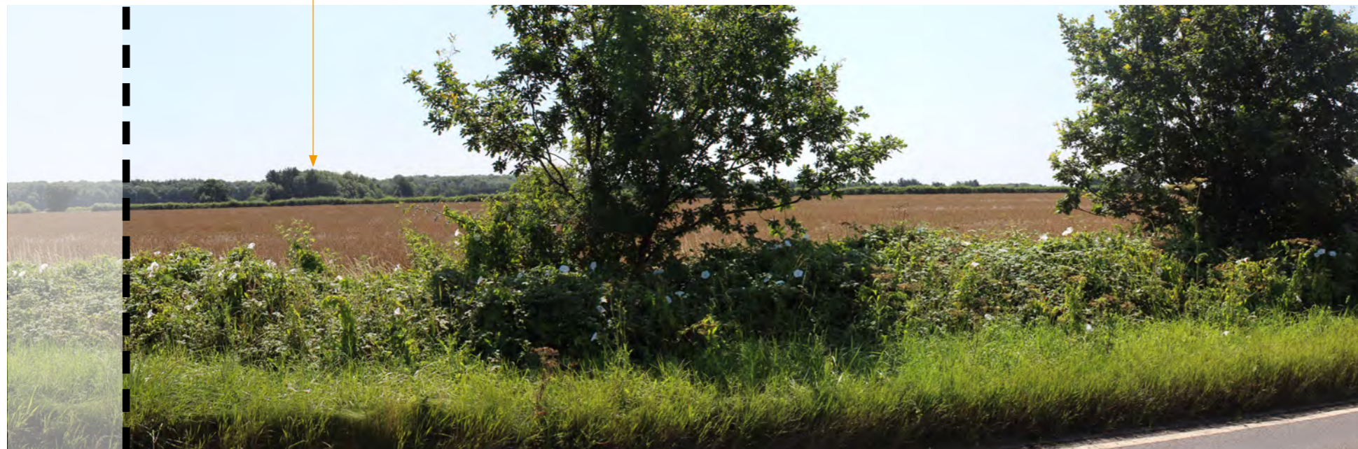
PHOTO VIEWPOINT 2B: VIEW EAST TOWARDS HETHERSETT FROM WITHIN THE STRATEGIC GAP (continued)

Note: Based on a viewing distance of 175mm and focal length of 50mm