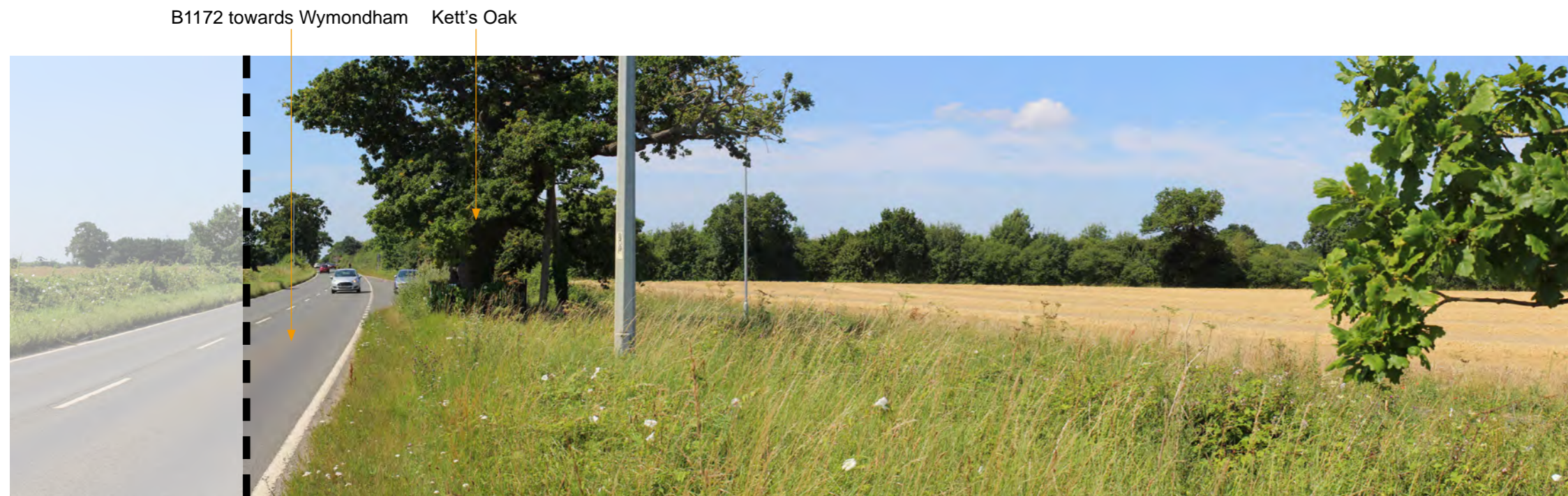
PHOTO VIEWPOINT 2A: VIEW WEST TOWARDS WYMONDHAM FROM WITHIN THE STRATEGIC GAP (continued)