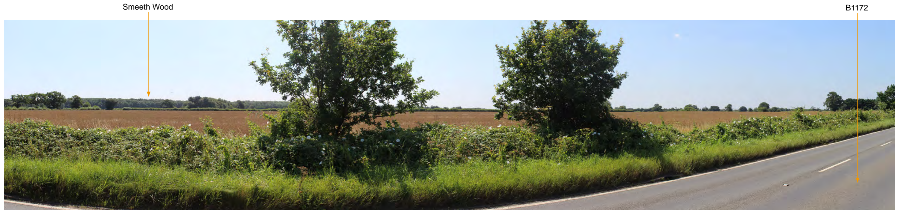
PHOTO VIEWPOINT 2A: VIEW WEST TOWARDS WYMONDHAM FROM WITHIN THE STRATEGIC GAP