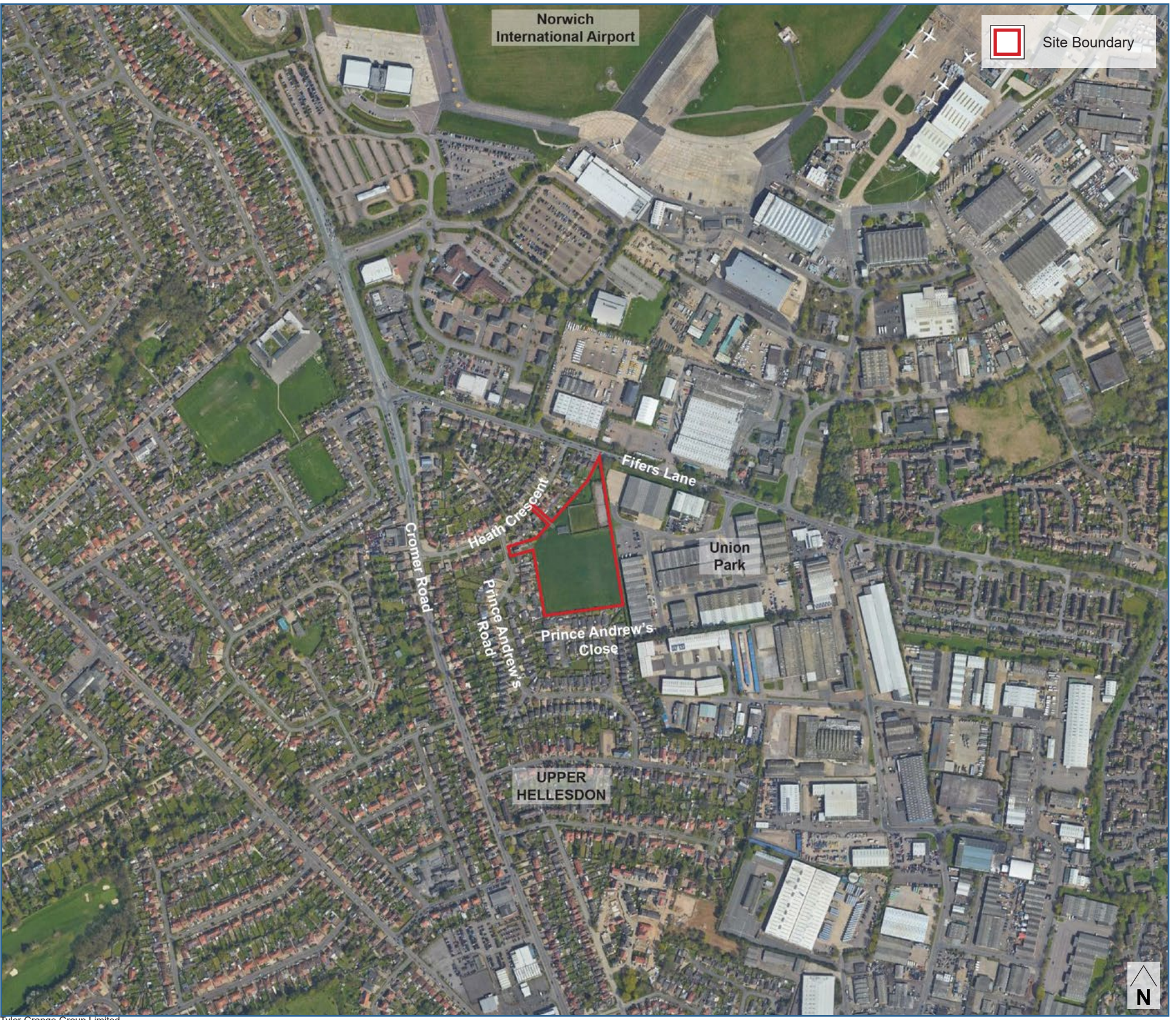
Plan 1: Site Location and Site Context (12790/P01)