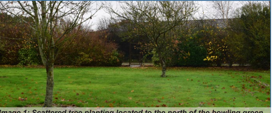
Image 1: Scattered tree planting located to the north of the bowling green.