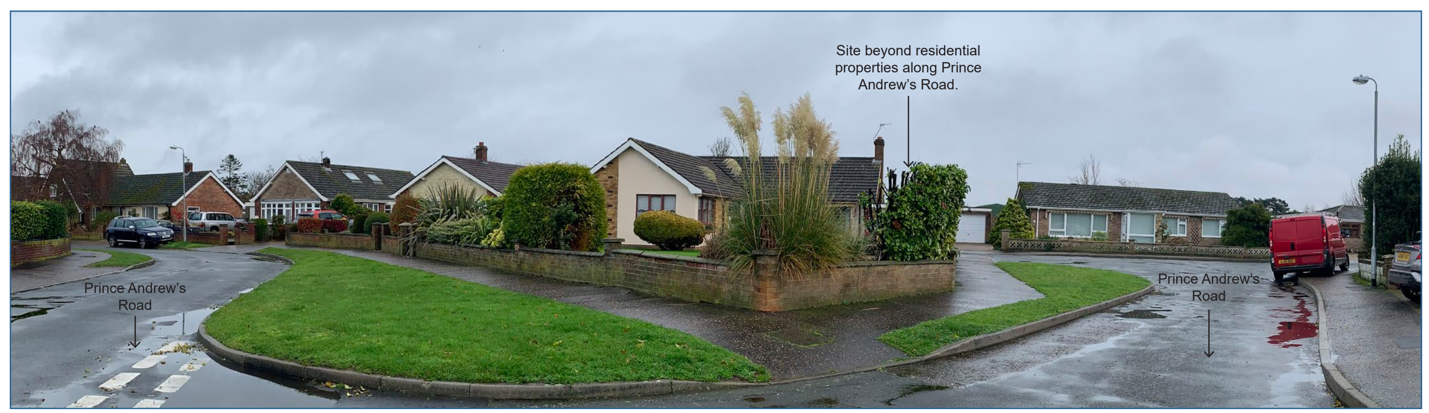
Photoviewpoint 2: Taken from Prince Andrew's Road. Orientation: East Distance from site: 60m