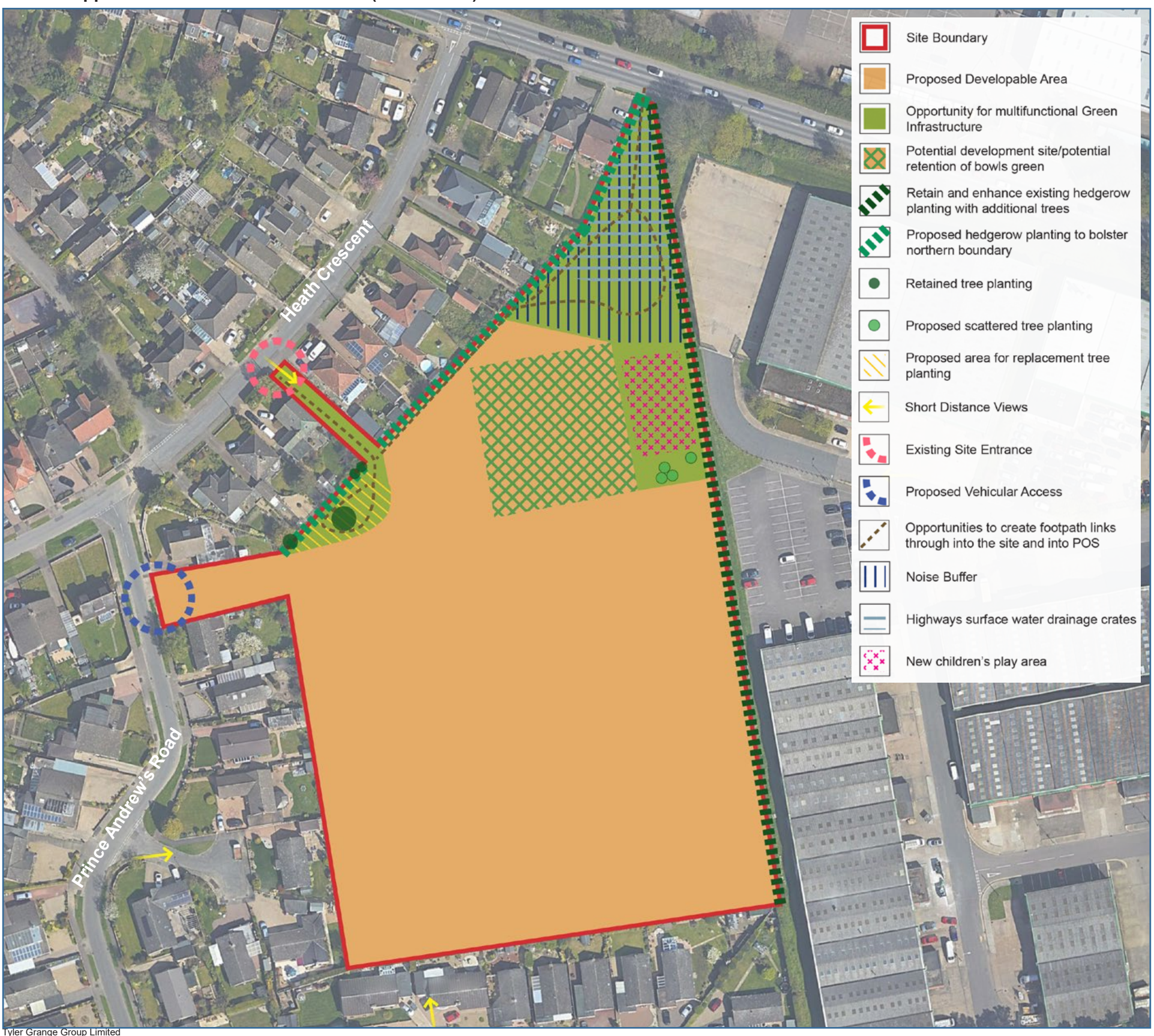
Plan 3: Opportunities and Constraints Plan (12790/P03b)