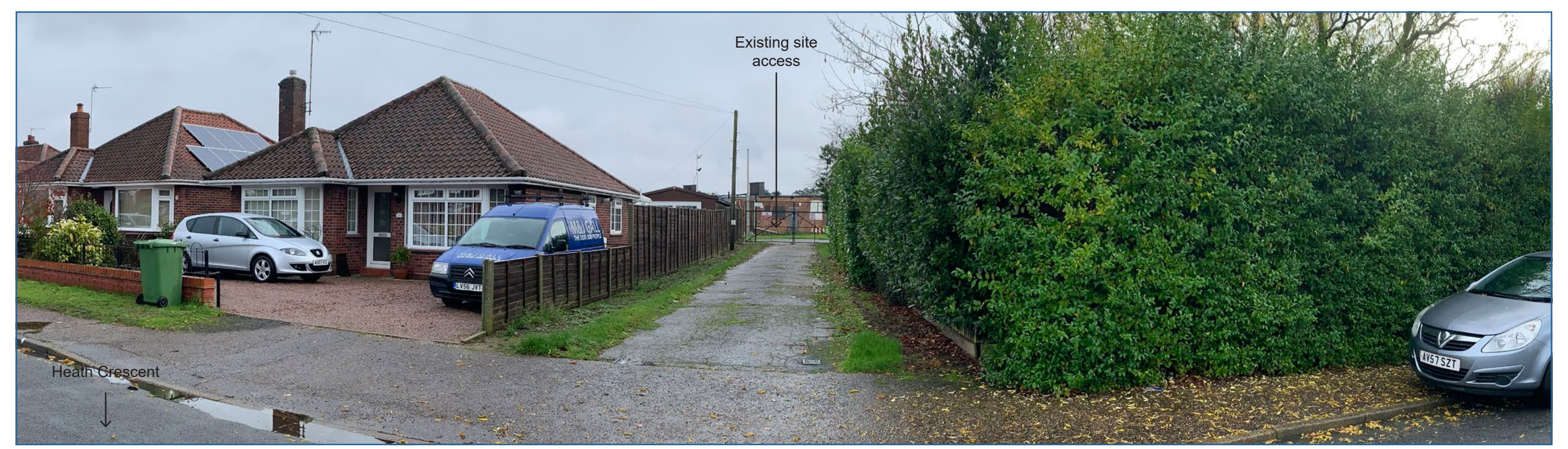
Photoviewpoint 1: Taken from Heath Crescent. Orientation: South-East Distance from site: 5m